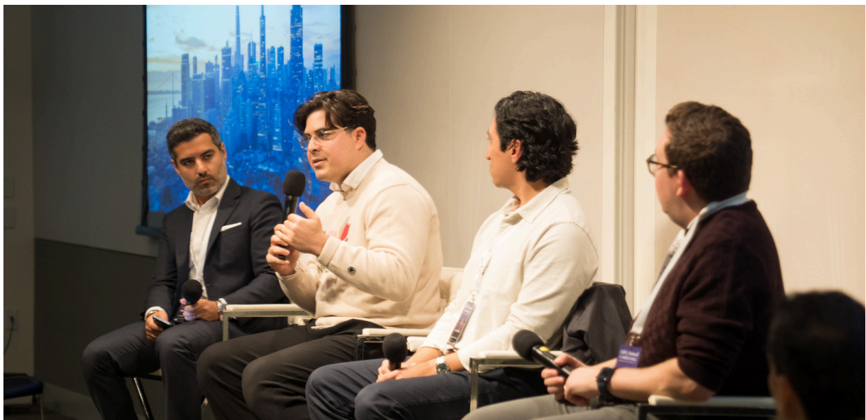
AI and Technology Panel, 2025 IABA Annual Conference, San Francisco

Membership dues support substantive education, with an emphasis on live programming through in-person events and webinars. These efforts provide timely and relevant legal information to community members. They also create meaningful opportunities for Iranian American legal professionals to share their expertise and contribute visibly to the broader legal discourse.