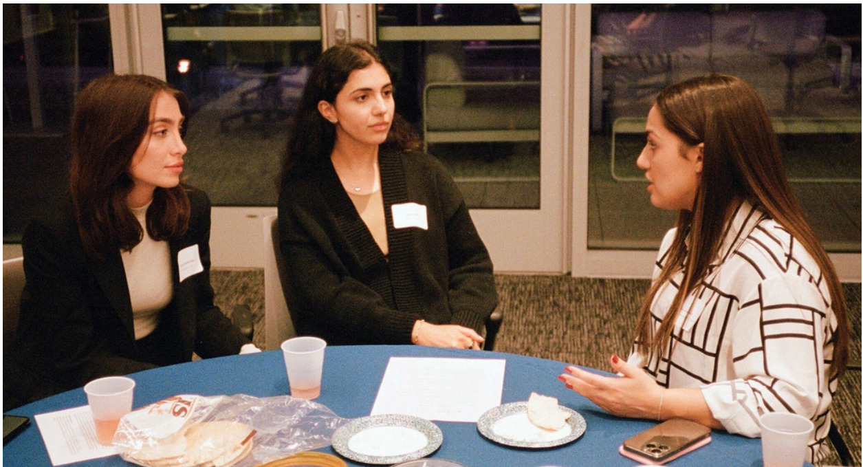
IABA Attorney speaks to Iranian American law students, at IABA Northern California Chapter's annual speed networking event

Membership funding supports law student mentorship initiatives that help develop the next generation of Iranian American legal professionals. These efforts reflect a long-term investment in the profession and in expanding access and opportunity within the legal community.