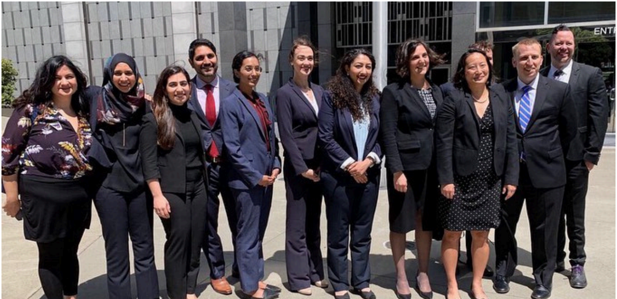
IABA NorCal and coalition partner attorneys after prevailing on summary judgment challenging the waiver provision of Travel Ban 3.0.

Membership support enables IABA to participate in impact litigation, including amicus efforts and strategic legal collaborations, to help protect the human, civil, and constitutional rights of Iranian Americans and other impacted communities. IABA contributes its legal expertise to cases with broader legal and societal implications, consistent with its role as a professional legal organization.